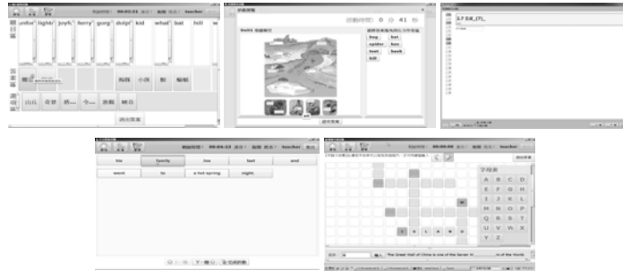
Figure 2. Snapshots of vocabulary exercises

There were 5 sub-exercises for each set of vocabulary exercises: matching, filling in the blanks, spelling, unscrambling sentences, and crossword puzzle. An on-screen version with a different visual exposure was prepared for the computer group (see Figure 2 below). The vocabulary tests included one pretest in the form of a recognition checklist and two posttests, immediate and delayed ones, which were composed of recognition and production parts. The post questionnaire was designed to explore learners' perceptions of learning in a computer-supported collaborative environment, with some open-ended questions included.