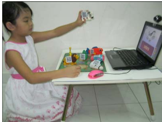
Figure 2. TangiLearn set up

TangiLearn , a manifestation of tangible multimedia, was developed for case study. This case study was an on-site evaluation took place in one of the kindergarten in Kuala Lumpur. It was conducted in a quiet classroom separated physically and acoustically from other classrooms to limit distractions. The case study was completed in one day. During the study, a laptop equipped with a camera, a set of tangible objects, and a normal display table suited to the participants' anthropometric characteristics was set up. The table was used as a space for participants to place and move the tangible objects (Figure 2). The tangible and multimedia objects binding were implemented through the adaptation of Quick Response (QR) code marker and Flash library. Implementation using open source library entails minimal monetary investments and times for development (Chau, Toh, Zarina, & Wan Ahmad Jaafar, 2012). QR code markers were attached on the tangible objects for binding purposes, and the children simply need to hold the tangible object and align to the camera mounted on the computer monitor.