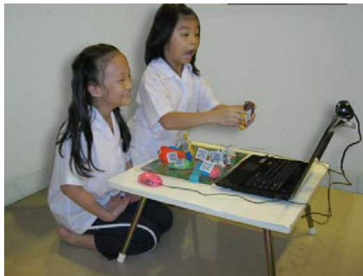
Figure 4. Parallel learning observed during the case study

Besides, we observed that there was peer collaboration similar to "parallel play" aroused in TangiLearn . "Parallel play" is a classic study of Parten (1932) in social participation. Accordingly, "parallel play" describes activity where children play side by side on the same activity that provokes equal social involvement (Scarlett, 2004, as cited in Xie, 2008). TangiLearn was a low-fidelity tangible multimedia prototype, and the Game section in the prototype was not created for evaluation yet. As such, the term "parallel play" was not suitable. Instead, we suggested the term "parallel learning" to reflect the similar kind of collaboration. In this case study, it was obvious that "parallel learning" existed. With pairs of two children sitting side by side using similar tangible objects for similar tasks in TangiLearn , they had the opportunity to discuss together, interacted with each other, exchanged ideas, passed around the tangible objects, and worked cooperatively to answer the quiz. We did not observe "sequential turn taking," or other kinds of collaboration such as "directive learning," and "competitive learning" aroused.