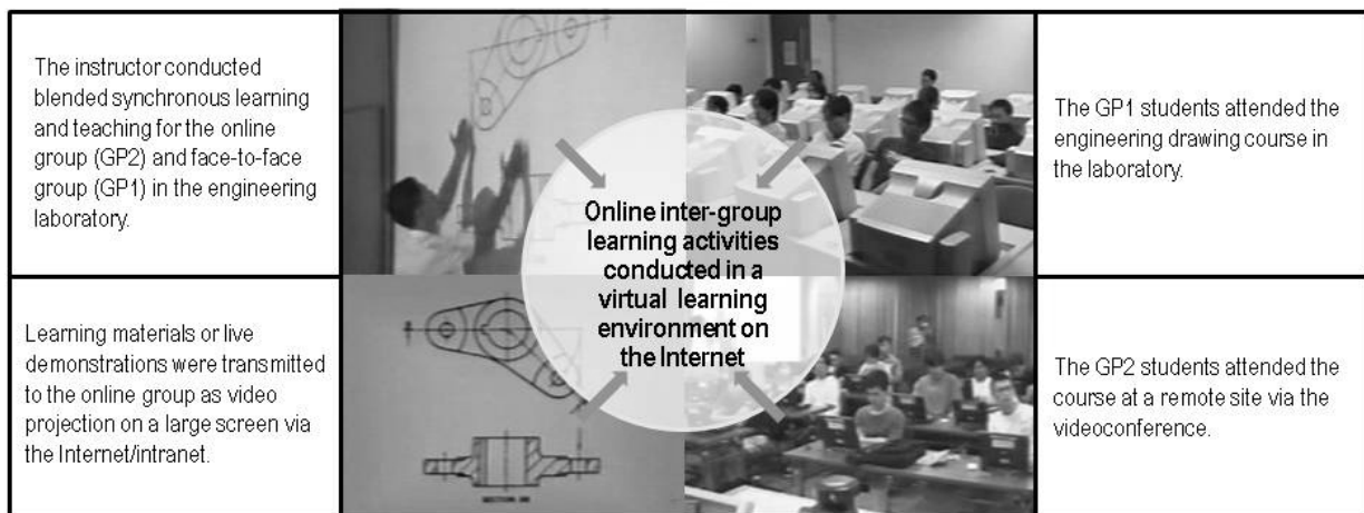
Figure 3: A snapshot of the blended synchronous learning and teaching.

The blended synchronous processes were captured on video tapes in a 4-in-1 recording format, while two researchers observed the sessions, one in the laboratory and one at the remote site, respectively (Szeto, 2013). Figure 3 shows a snapshot of the adapted blended synchronous learning and teaching: