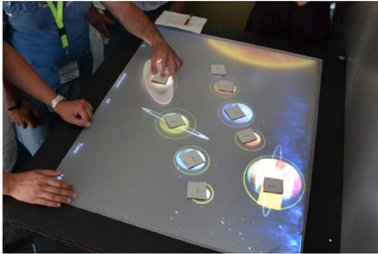
Fig. 1. Matching item