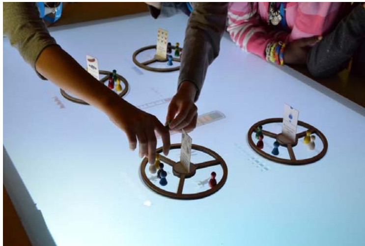
Fig 5. The system in use by a group of children