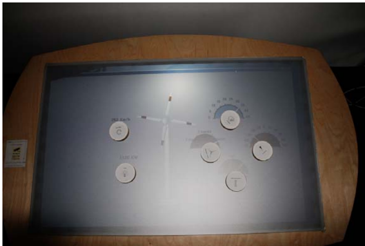
Fig. 2. Simulation item

A description of the outcomes of these studies can be found in Ras et al. (2013). In summary, it was interesting to observe that different spaces were used to intensively communicate using gestures, talk, and physically manipulating objects. Besides the interactive surface also the space between participants or even the non-reactive border of the table was used to solve the item (e.g., to sort, group, or even exclude tangibles). The large space of the TUI allows for more than one person to get actively involved. But the position at the table also reveals that a person might feel responsible for a specific space (or even tangibles) or cannot access other spaces because of the distance or the closeness to another participant. We observed that all activities across space support the participants to acquire knowledge about the problem situation and apply the acquired knowledge, which are two important dimensions of ColPS (Funke, 2001; Greiff et al., 2013).