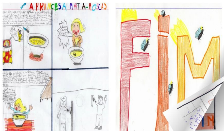
Image 1: A few pages from the comic e-book created by the students (Story: A princesa mata-moscas )

Firstly, the teacher read each story once out loud for the class and they all debated its context in open class. Then, students were divided into heterogeneous pairs and each was assigned a story to convert into a comic by sing their own drawings. After this phase, the comics were collect and the creation of the e-book was started, a process already familiar to the students. Note that whenever a setback occurred the teacher would guide or suggest a new process. Before they finished this project, the students were told about the e-book offering to the author and that it would be preceded by a public presentation in a party where several elements of the educational community would be present, an idea that was met with great enthusiasm. We can see on [Image 1] an example of some of the e-books pages, with some illustrations of the comic created by the students about the story “ A princesa mata-moscas ”.