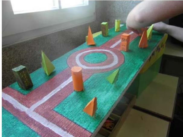
Image 3: Model with geometric solids build by the participants in the study.

Educational objectives: in the end of the exercise the students should be able to: construct models of plane figures and geometric solids from A4 sheets of paper, distinguish between terminology related to geometric plane shapes and geometric solids; identify plane and solid geometric shapes: define and distinguish the concepts of perimeter, area and volume; calculate perimeter measurements, area measurements and volume measurements.