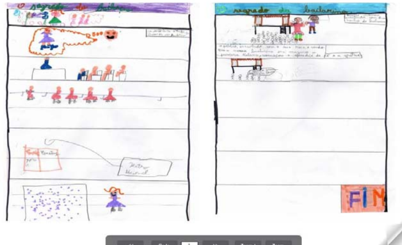
Image 5: Some pages from the comic e-book created by the students (Story: O segredo da bailarina )

Development: the teacher handed out to each student a square paper sheet and a work sheet with questions related to the story, where they had to identify the relative positions of ballerina's friends in the theatre (see [Image 5]), painting each position with different colours.