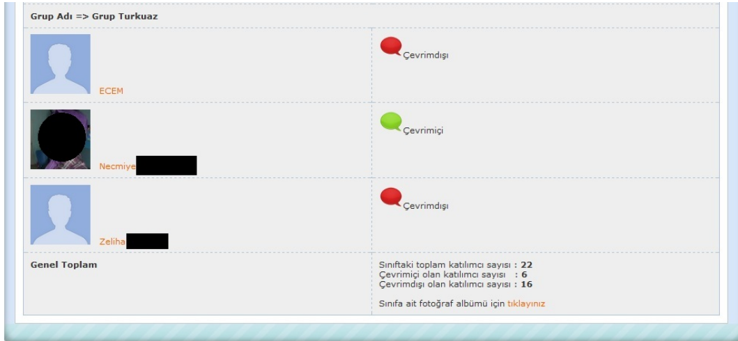
Figure 2. Status of the users

An evaluation point is given in four different categories at the end of the learning activities; participation of the students in discussions at BLOG site , project implementations in scope of semester end activity, evaluation of the result by watching and implementing the videos including C# courses and academic success test which its reliability and expert opinion has been provided in the previous semester.