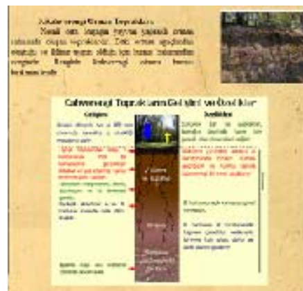
Figure 3: Presentation Page