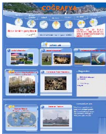
Figure 1: Unit Introduction Page

The announcements section includes questions for students, activity assignments, and other announcements concerning the application.