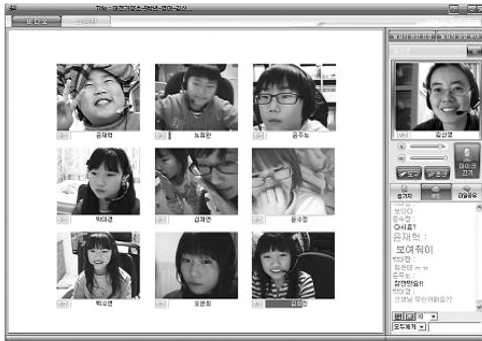
Figure 2. Screenshot of CHLS-VC class

CHLS-VC follows a similar suit in how the system operates. In CHLS, online interaction between students and teachers played a significant role in teaching and learning and students and teachers used the Bulletin Board System (BBS), phone, or email for communication and interaction. However, it is commonly accepted that face to face interaction is the most effective type of student to teacher interaction. In addition, asynchronous and synchronous CMC tools in online environment are found to facilitate communication as well as collaborative and cooperative learning in primary and secondary school students (Lee, 2004). Moreover, the teachers who volunteered for CHLS have also expressed that it was difficult to overcome the limitations of online environment in having in-depth interaction with students in comparison to offline classrooms. To overcome such limitations, video conferencing function was added to CHLS, which resulted in CHLS-VC in 2009, and CHLS-VC began service in 2010 (KERIS, 2010). In other words, CHLS-VC is an expansion of CHLS with an addition of video conferencing, and it serves to provide learning support as well as consultations for marginalized students and those from low-income families. Figure 2 shows the main screen of the CHLS-VC class.