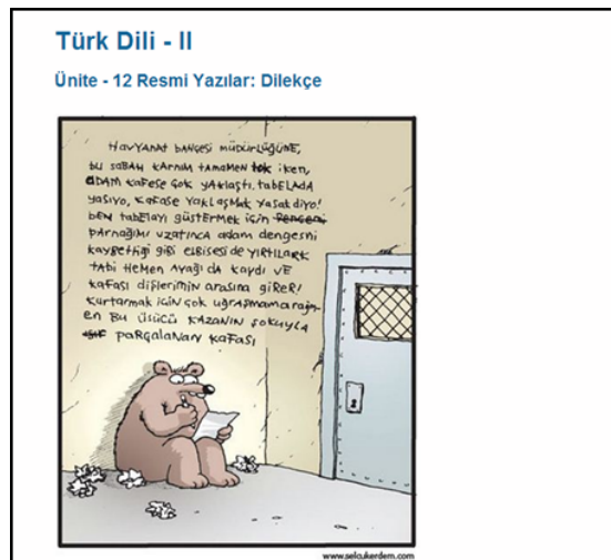
Figure 3. A caricature to make writing petition more interesting

After the students analyzed the petition in framework of guiding questions and became mentally prepared some caricatures were presented to strengthen the connection between real life and the problem and to make it more interesting as figure 3 shows.