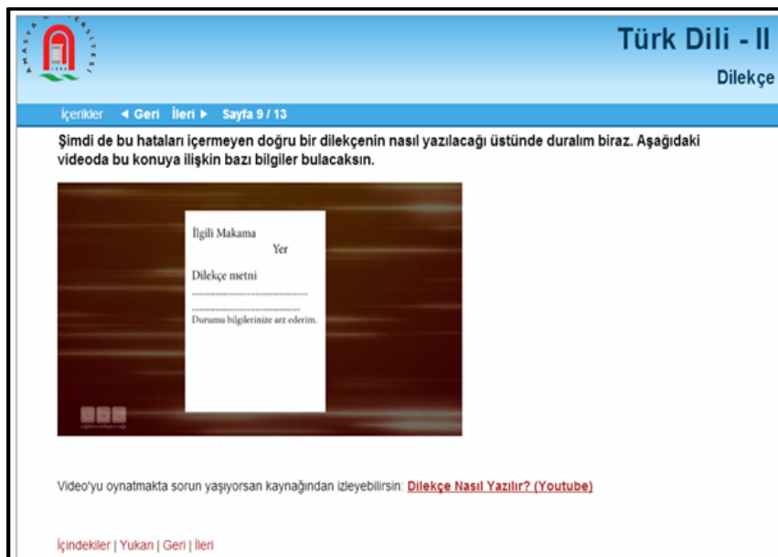
Figure 4. A video as an information resource

Later, the right of petition was discussed to answer student questions such as “Why should I write a petition?” and to let every individual discover their own reason.