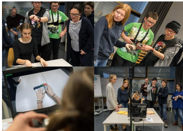
Figure 2: Format development workshop

Buzzfeed's Nifty format provided the foundation for developing the basic format framework and a graphical layout for a multicam format. Although the videos feature people preserving nearly forgotten handcrafting skills, the ethnographical aspect was not relevant for the project. The video was to solely focus on the artisanship and the key elements of producing the pieces. All details such as the choice of material, the exact time of harvest and the quality standards of the wood had to be explained. The schematic narrative structure entailed the following main elements: