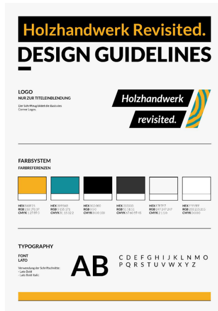
Figure 3: Style Guide Stiefelbauer, p 41.

The use of colors, fonts and a logo was defined in a style guide. The only font used was Lato in bold and bold italics. The highlight colors yellow and turquoise provide visual emphasis of graphical and textual elements. (figure 3.)