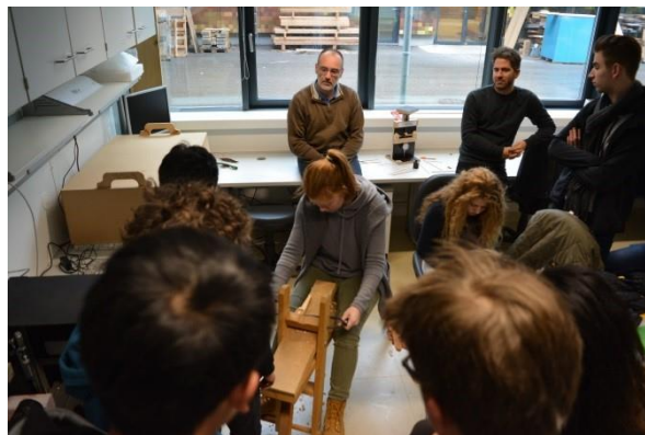
Figure 1: Pupils at the workshop

In a second workshop, the team focused on format development and discussed the examples. In small groups, first steps towards a format for four of the chosen topics – hewing of logs, wooden nails, birch besom and fence ring – were taken. (figure 1)